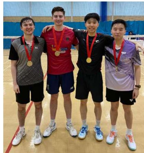
Oxford CSBC Senior Bronze runner-up