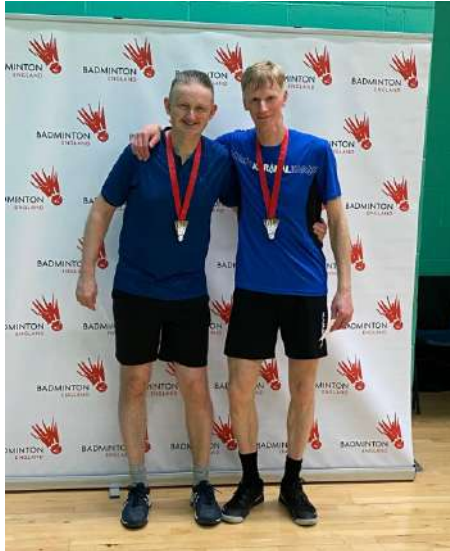
English National Champions O50 doubles