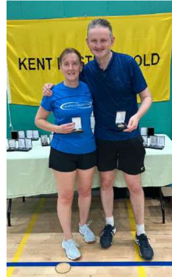
Kent masters O50 mixed winners