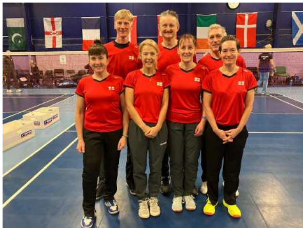
James McCoig Trophy winners (team event)